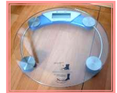
A shiny, new scale!

a nice new scale that will be much easier and more pleasant for the children and the aunts! It was recently delivered to the orphanage and tried out by the kids!