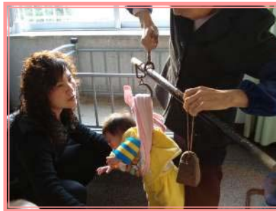
The ‘antique’ scale